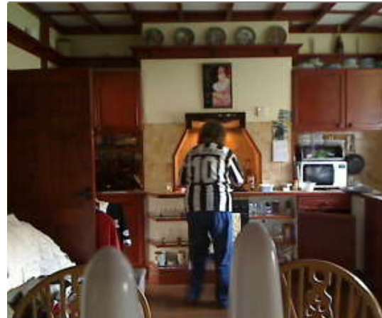
Figure 1: Making an omelette. In the real world, people ignore our handiwork! (note Nabaztag ears in the foreground)

The focus has turned out to be on robots rather than embodied conversational agents and the robot of choice was a Nabaztag. The Nabaztag is a commercially produced talking head from Violet in the